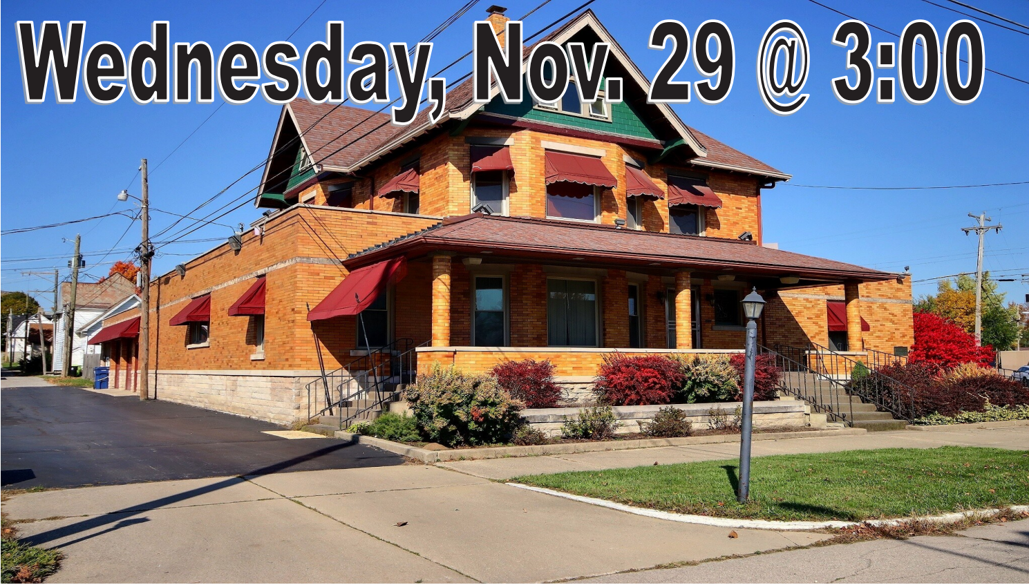
338 E. Washington St., Huntington, IN 46750